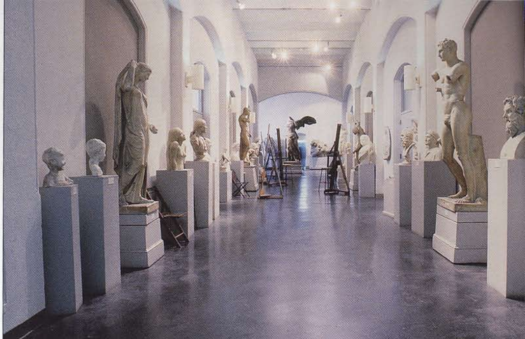
Fig. 13: The cast corridor at the Pennsylvania Academy of the Fine Arts, ca. 1990.