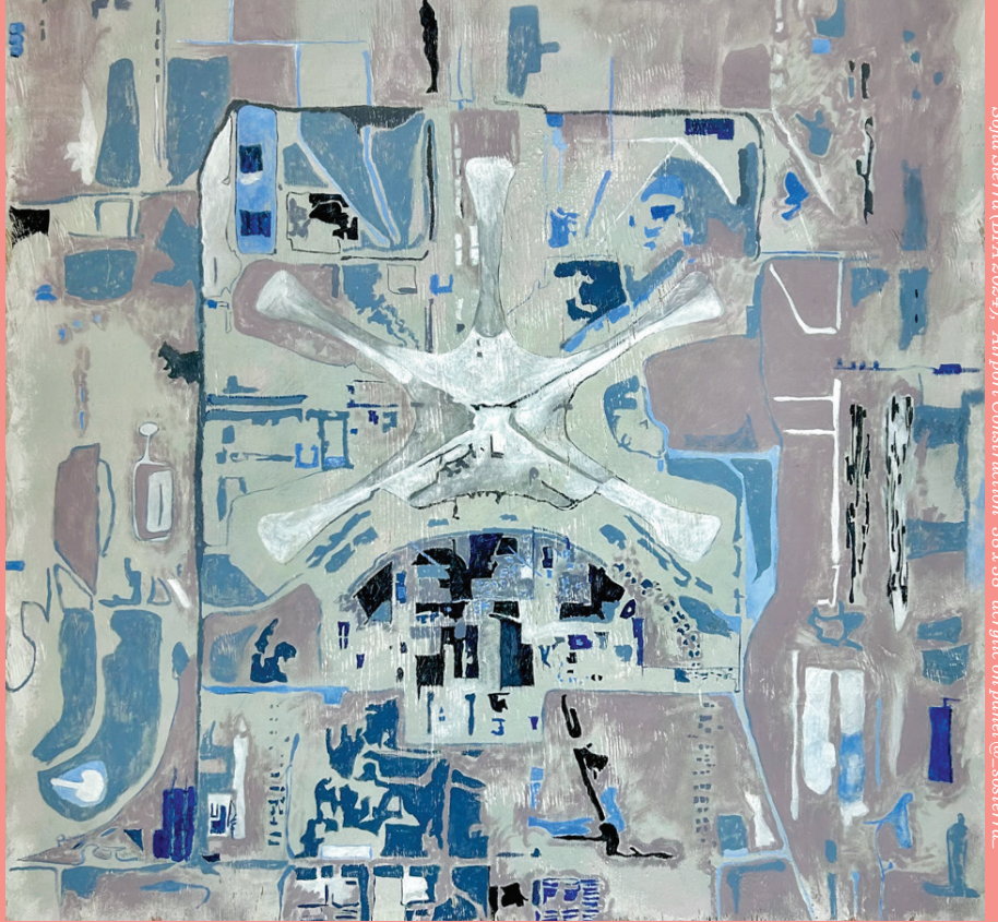
Sofia Sierra (BFA 2024), "Airport Construction" 38 x 38" acrylic on panel @ sosierra