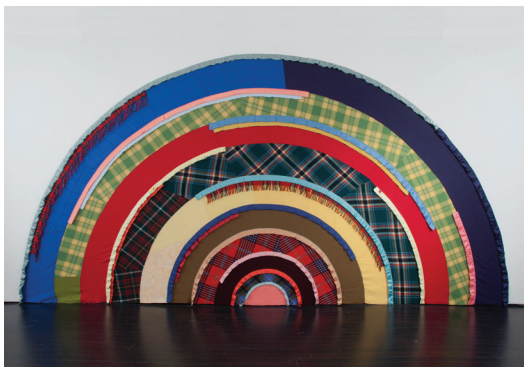
Marie Watt (b.1967) Skywalker/Skyscraper (Allegory) , 2012 Reclaimed wool blankets, satin binding, thread 119 x 228 in.