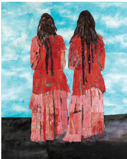
Maria Berrio (b.1982) The Oracles' Silence , 2019 Collage with handmade Japanese papers, magazine papers, Jade glue and charcoal on canvas, with matt medium 60 x 48 in.