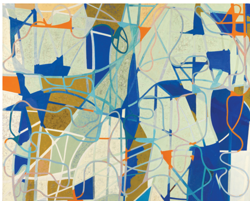
Neil Anderson (b.1933) Apollo 2 , 2009 Oil on linen 50 x 40 in.